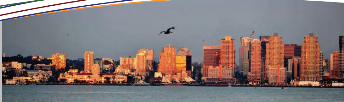
San Diego Skyline

President's Message P.1 Industry Issues P.2 Committee Highlights P.2 Event Reports P.3 In the News P.6