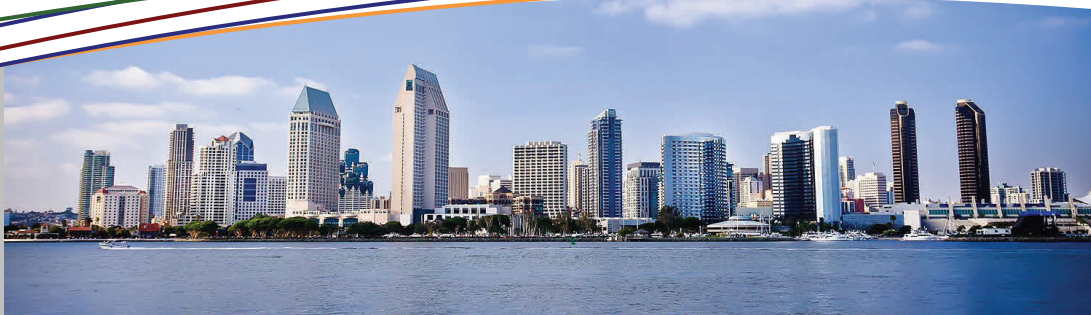
San Diego Skyline