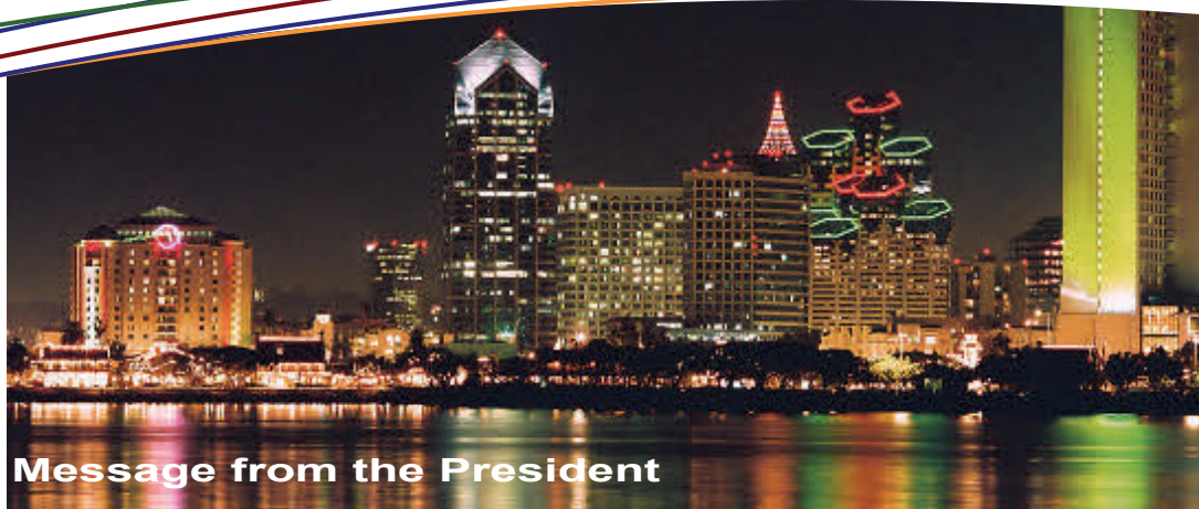
The San Diego Skyline all dressed up for the Holidays

President's Message P.1 Industry Issues P.2 Committee Highlights P.2