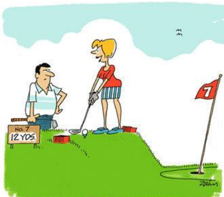
"I love the women's tees on this course!"